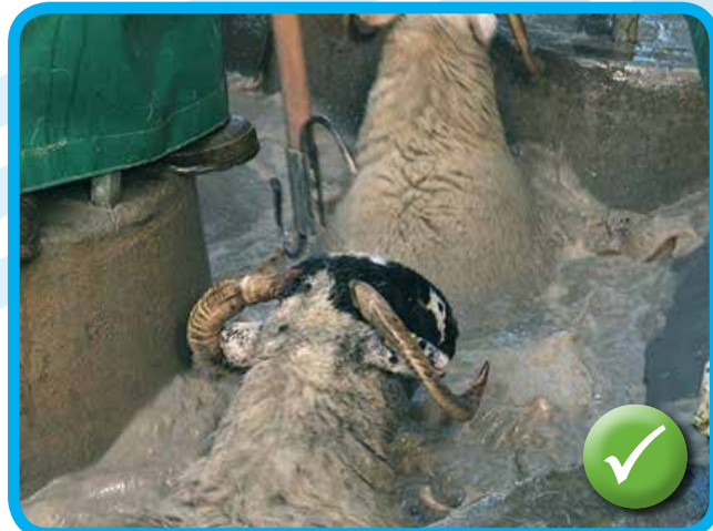
Make sure all splashes and spills are contained within the sheep dipping facilities.

Waste sheep dip must be disposed of in accordance with the conditions of your SEPA licence.